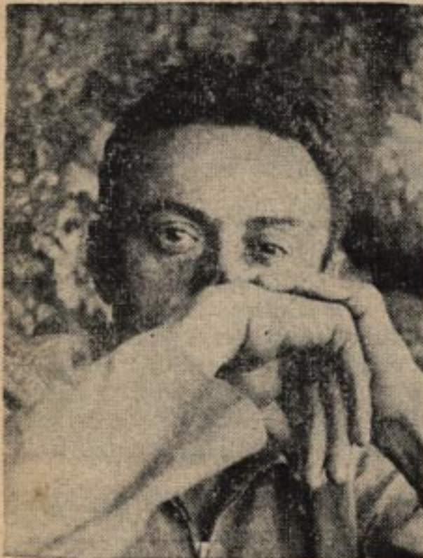
Speak No Evil