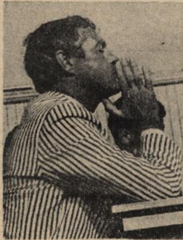
See No Evil