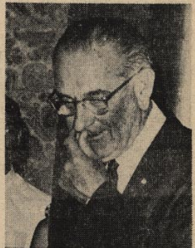
Smell No Evil