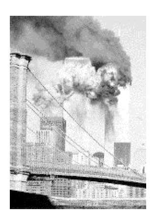
The World Trade Center towers explode and burn after being hit by planes Sept. 11.

"I wonder why many questions are not asked," von Buelow said. "For 60 decisive minutes, the military and intelligence agencies let the fighter planes stay on the ground; 48 hours later, however, the FBI presented a list of suicide attackers. Within 10 days, it emerged that seven of them were still alive."