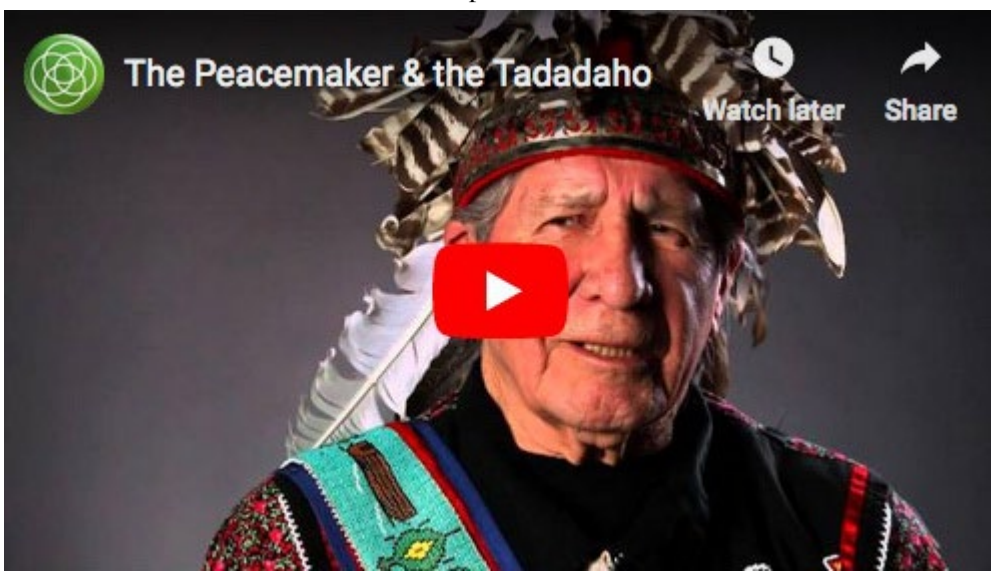
MP3 recording (10:01, 11.1MB)

This short film is part of 8 short, testimonial films, on the Haudenosaunee (Iroquois.) The Iroquois are embarking on an historic project about the 500-year history of the Iroquois, their relationship with Europe and America and their prophesies that, if heard, can help us navigate the oncoming changes due to climate change. This series of short films is done via their testimony, and creates the space for the Iroquois to tell their story as they strive to uphold the traditions and the legacy of their people while also protecting the central tenets of their people and their relationship and care for the Earth.