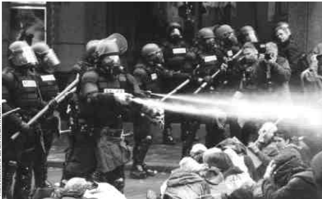
Police use chemical agents on demonstrators. Not only were protesters and bystanders injured, so were police. At least one officer exposed to these chemicals experienced heart problems, according to SPD reports.