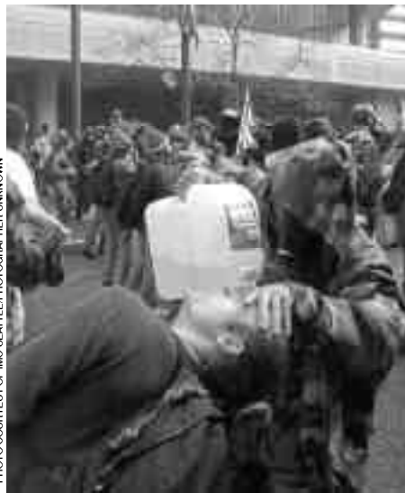
The manufacturer stipulates that all persons exposed to chemical agents are to receive immediate treatment from law enforcement personnel. Instead, protesters and bystanders alike relied on volunteer medics.

The window breaking took place more than two hours after the police had fired their rubber bullets and launched their