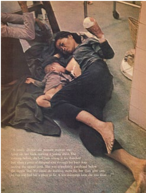
"A lovely 28-year-old peasant woman was lying on her back nursing a young child. The evening before, she had been sitting in her thatched hut when a piece of shrapnel tore through her back transecting the spinal cord. She was completely paralyzed below the nipple line. We could do nothing more for her than give antibiotics and find her a place to lie. A few mornings later she was dead."

Following reports in the 1980s of the U.S. -armed, -funded, and -trained death squads in Central America, the thought kept surfacing: ‘If only people in the U.S. could see factual footage of how our government is directly and covertly involved in on-the-ground torture and murder of innocent people south of the U.S. border, they would en masse demand it stop.’ There are many articles and books that catalog and enumerate sources concerning post-WWII United States military aggressions and intelligence agency covert operations both domestic and foreign.[1] The focus here is an especially potent photographic essay on the consequences to the people of Vietnam from the U.S. war in their country.