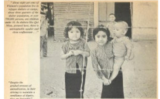
"Despite the gradual process of animalization, in their striving to maintain a semblance of dignity, they are beautiful..."