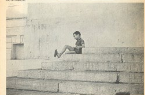
"Despite the gradual process of animalization, in their striving to maintain a semblance of dignity, they are beautiful."