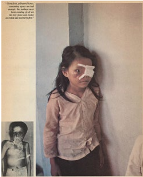
"Tom flesh, splintered bones, screaming agony are bad enough. But perhaps most heart-rending of all are the tiny faces and bodies scorched and seared by fire."

files to him that went well beyond what was published in the Ramparts piece in terms of photographs. Some of you probably saw, if you're old enough to remember, a number of those photographs. Portions of them used to appear on lampposts and windows of burned and deformed children. That was what gave him pause. He hadn't had a chance to read the text at that point but it was the photographs that stopped him.