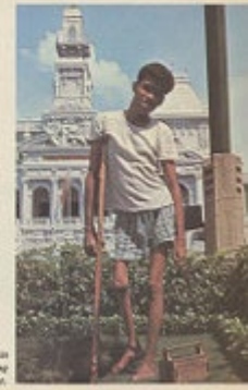
He was deformed by polio, but he stood in front of Saigon's City Hall every day—shining shoes, staying alive.