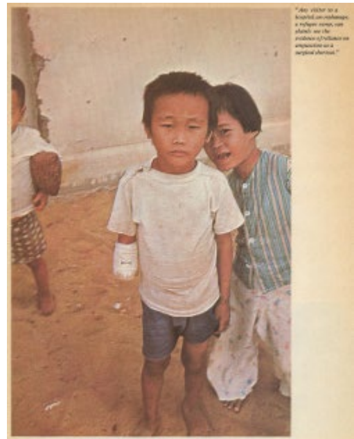
“Any visitor to a hospital, an orphanage, a refugee camp, can plainly see the evidence of reliance on amputation as a surgical shortcut.”

There is no one to provide such care for most of the other horribly maimed children of Vietnam; and despite growing efforts by American and South Vietnamese authorities to conceal the fact, it's clear that there are hundreds of thousands of terribly injured children, with no hope for decent treatment on even a day-to-day basis, much less for the long months and years of restorative surgery needed to repair ten searing seconds of napalm.