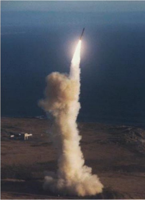
Launch of a Minuteman III.

on JFACC recommendations and the conditions in the JFC's area of responsibility. Apportionment will likely change as the campaign progresses or as the operational situation changes. Early in a campaign the effort may center on counterair and strategic attack. An enemy ground offensive may then necessitate a larger percentage of the total effort be dedicated to close air support (CAS) over strategic attack. If a situation develops that would change target priorities (i.e., Iraq's attack on Khafji), air and space forces can respond almost immediately due to their flexibility.