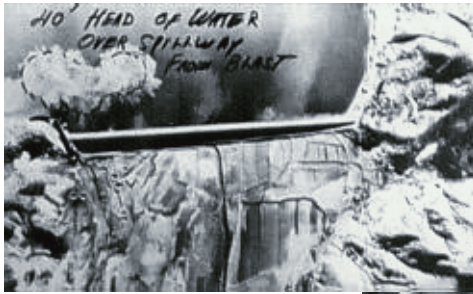
Chasan Dam during (left) and after (below) the May 1953 attacks.