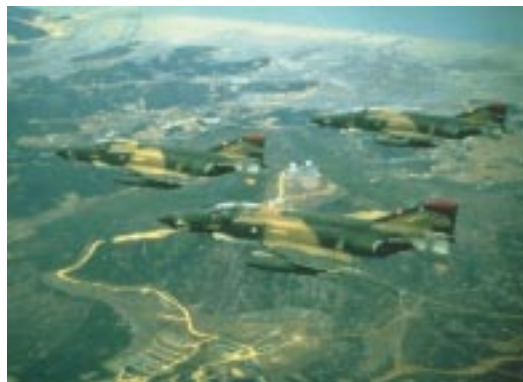
A formation of Vietnam-era F-4 Phantom IIs.

The Vietnam conflict began the change in how airpower planners thought about the use of fighters and heavy bombers. Heavy bombers, the weapons of choice for World War II strategic warfare, were